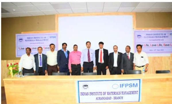
IIMM_Aurangabad Team with Faculty