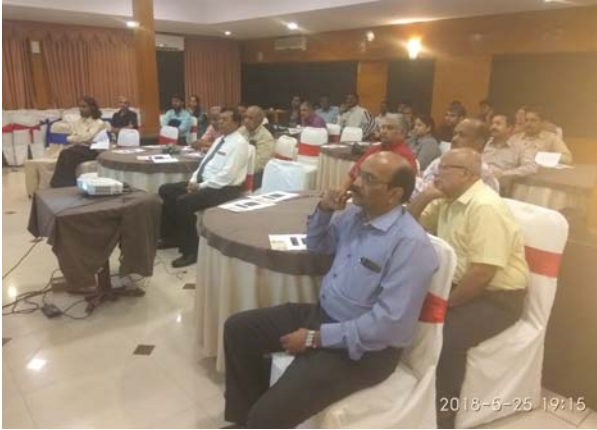
A view of participants for Lecture program