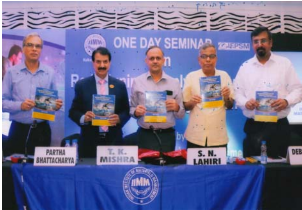
View of Inauguration of Souvenir printing on the occasion of Seminar held.