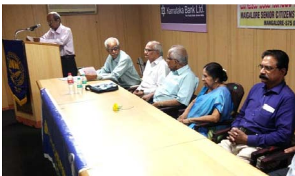
Welcome Speech by MASCA Member