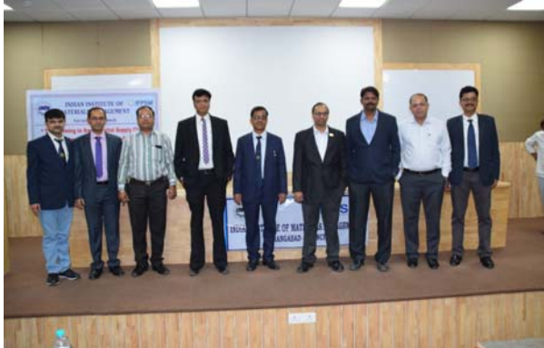
IIMM Aurangabad Team with Faculty