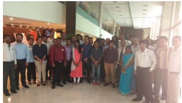
A group of Participants attended from various Hospital for workshop at Royal Orchid Central