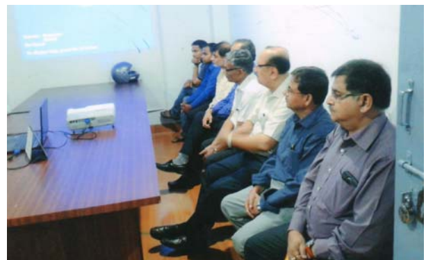
A view of audience

Report on the Evening Lecture held on 4 th June 2018 at 19.00 hours at IIMM Lucknow Branch : An evening lecture was arranged on 4 th of June 2018 at the IIMM Premises wherein 2 speakers from various fields shared their experiences.