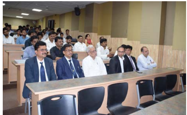
Large audience attending the session