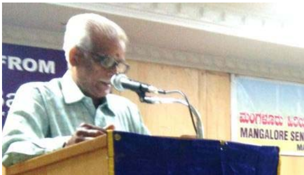
Performing MC by MASCA Branch Secretary