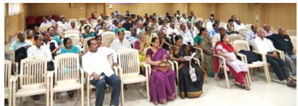
Branch members & audiences relishing the talk