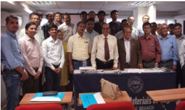
The Group Photos of Participants attending MDP Workshop.