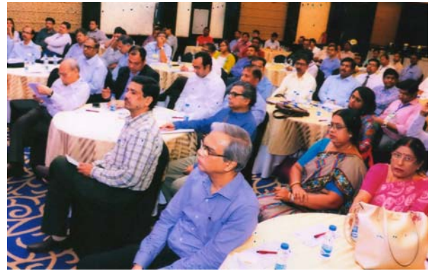
On the Occassion of One Day Seminar held on 2.6.2018 at Hotel Hindustan International Organised by IIMM, Kolkata, view of Sr. Members of Delegate sitting in the Seminar Hall