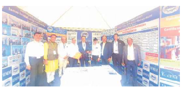
ICEEM College Executive Committee visited IIMM Stall during Expo