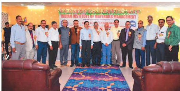
Group Photo on the occasion of One –day Seminar at Raebareli Branch on 19 th Mar'23.