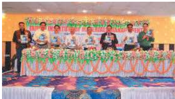
Release of Souvenir on the occasion of One-day Seminar at Raebareli Branch on 19 th Mar'23