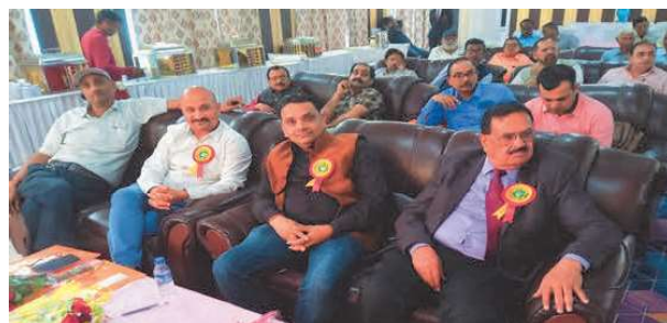
Attentive Delegates during Technical Session - Seminar at Raebareli Branch on 19 th Mar'23