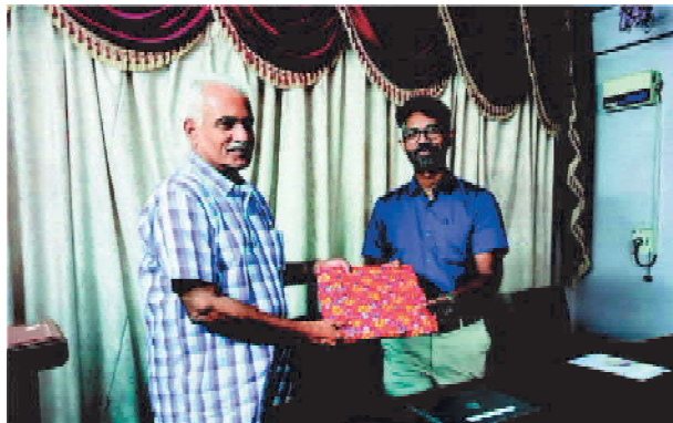
Branch Chairman presenting memento to the Chief Guest

Directorate General of Supplies and Disposals (DGS&D) in 2016. Since its inception, GeM has brought in the visibility and transparency in public procurement. GeM's three key pillars – Efficient, Transparent and Inclusiveness – ensure that business in the Government e Marketplace is quick and easy.