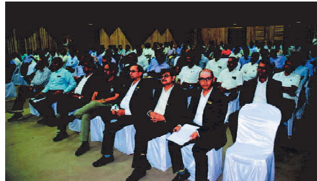
Delegates attended Seminar on 20th April 2023 Aurangabad Branch

the key drivers of economic growth. From the economic standpoint, for developing countries like India, supply chains create opportunities, augment productivity, improve technology and skills, increase employment, and diversify exports. Long-terms business relations ensure more income and uninterrupted revenue.