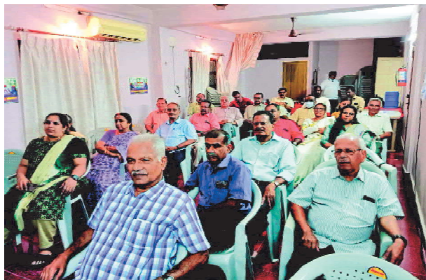
A view of the audience

It is inclusive since it allows anyone and everyone to do business on GeM. Efficient for conducting business operations smoothly and Transparent for fair business practices. In addition the platform seeks to improve openness, effectiveness and speed in public procurement. It offers a wide range of procurement methods including direct purchase, electronic bidding, electronic reverse auction and direct reverse auction.