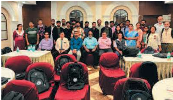
Group of Delegates with Faculty