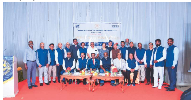
IIMM- Bangalore Golden Jubilee Celebration - Organising Team