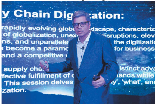
SCALE 2023 - Speaker from Manhattan handling the session