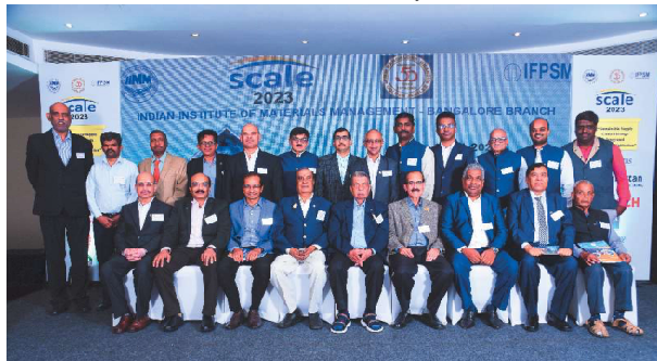
SCALE 2023 - Organising Team