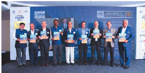
Releasing SCALE 2023 - Golden Jubilee - SOUVENIR