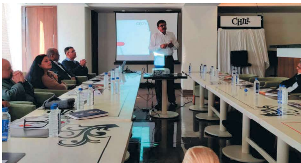
Programme at Indore Branch