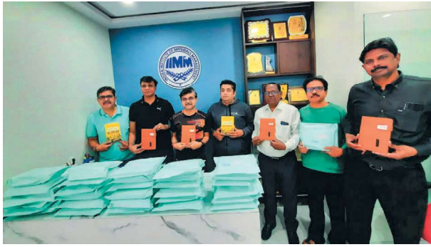
IIMM Aurangabad Branch has distributed 500 New year welcome kit to Materials Management professionals.