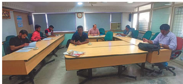
A view of Candidates Appeared for Entrance Exam

24 th January 2024 – COLLABORATION With SJIM : Industry ready students are need of India today and for the next 10 years. IIMM Bangalore branch has taken lead in this and made an MOU with SJIM (St Joseph Institute of Management). Next step is to leverage the strength of SJIM for IIMM Members and SCM Professionals and as well with Expertise real life knowledge of our Faculty and SCM professionals we started the 1 st discussion to co-create suitable courses with SJIM.