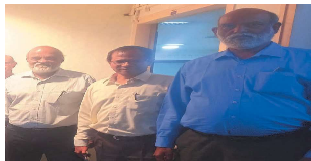
IIMM Bangalore Branch and St. Joseph's Institute of Management (SJIM) had a meeting on 24th Jan 2024