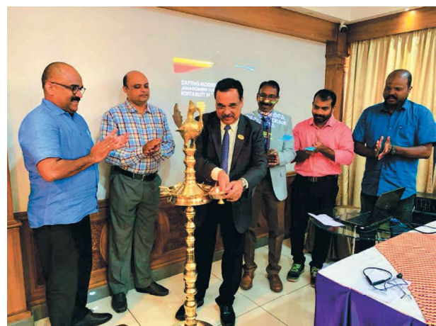
Cochin Branch : One Day Training Programme for Executives at Cochin.