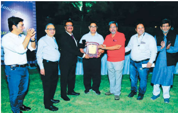
Ahmedabad branch is having 10 Active chairmans, who are regularly attending IIMM Ahmedabad branch function. Sharing pic of 6 Chairman welcoming guests of honour in our last MM day program.