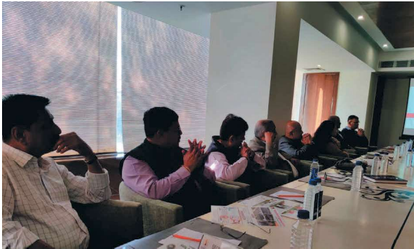
Programme at Indore Branch