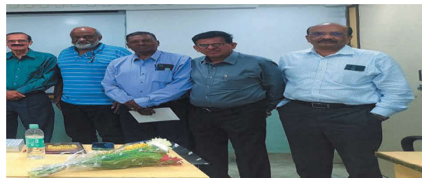
Brainstorming Session for Branding IIMM Bangalore Branch a view of Committee Members with Branding Expert