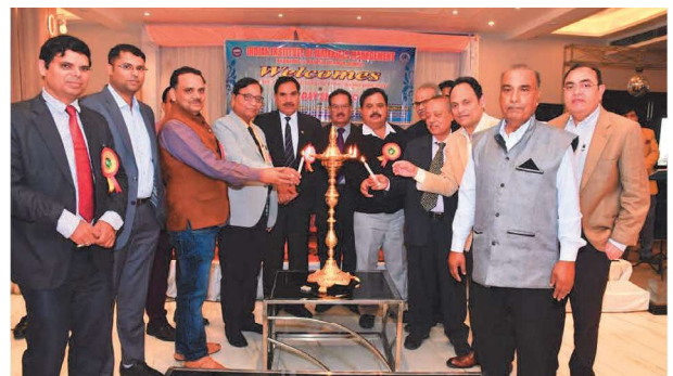
Lightening of the lamp on the occasion of One-day Seminar at Raebareli Branch on 3 rd Mar'24