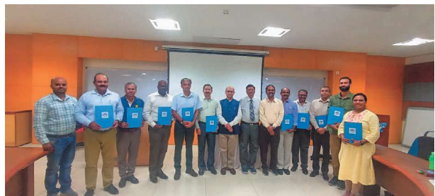
A View of Training Participants with Certificates