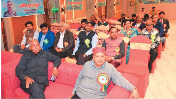
Attentive Delegate(s) on the occasion of One-day Seminar at Raebareli on 3 rd Mar'24