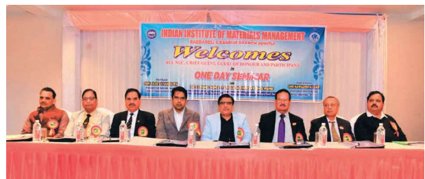
Dignitaries on the occasion of One-day Seminar at Raebareli Branch on 3 rd Mar'24