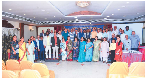
A view of group photo of Members present on AGM 24.08.2024