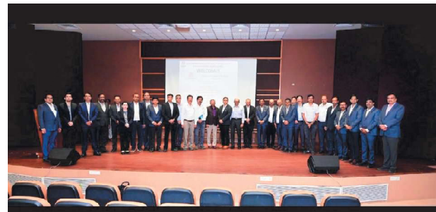
Group Photo with TOYADA Gosei South India Ltd