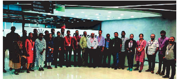
Participants and Faculty- ITP Conducted for Colin Aerospace on 26.09.2024