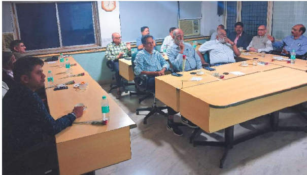
A view of Faculty attended for Teachers day celebration