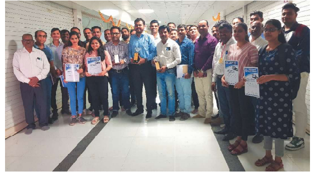
Group Photo with Faculty Participants of SAP MM Training on 22nd Dec. 2024